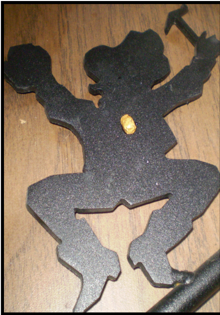
Largest Nugget at June meeting in Libby.