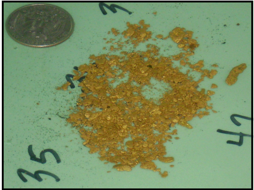
Gold split for June. Split 55 ways, which was the largest split to date.